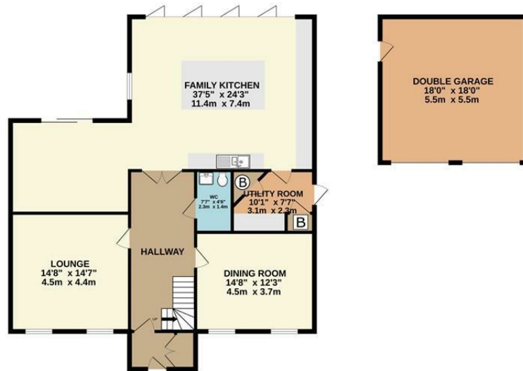
GROUND FLOOR 1631 sq.ft. (151.5 sq.m.) approx.