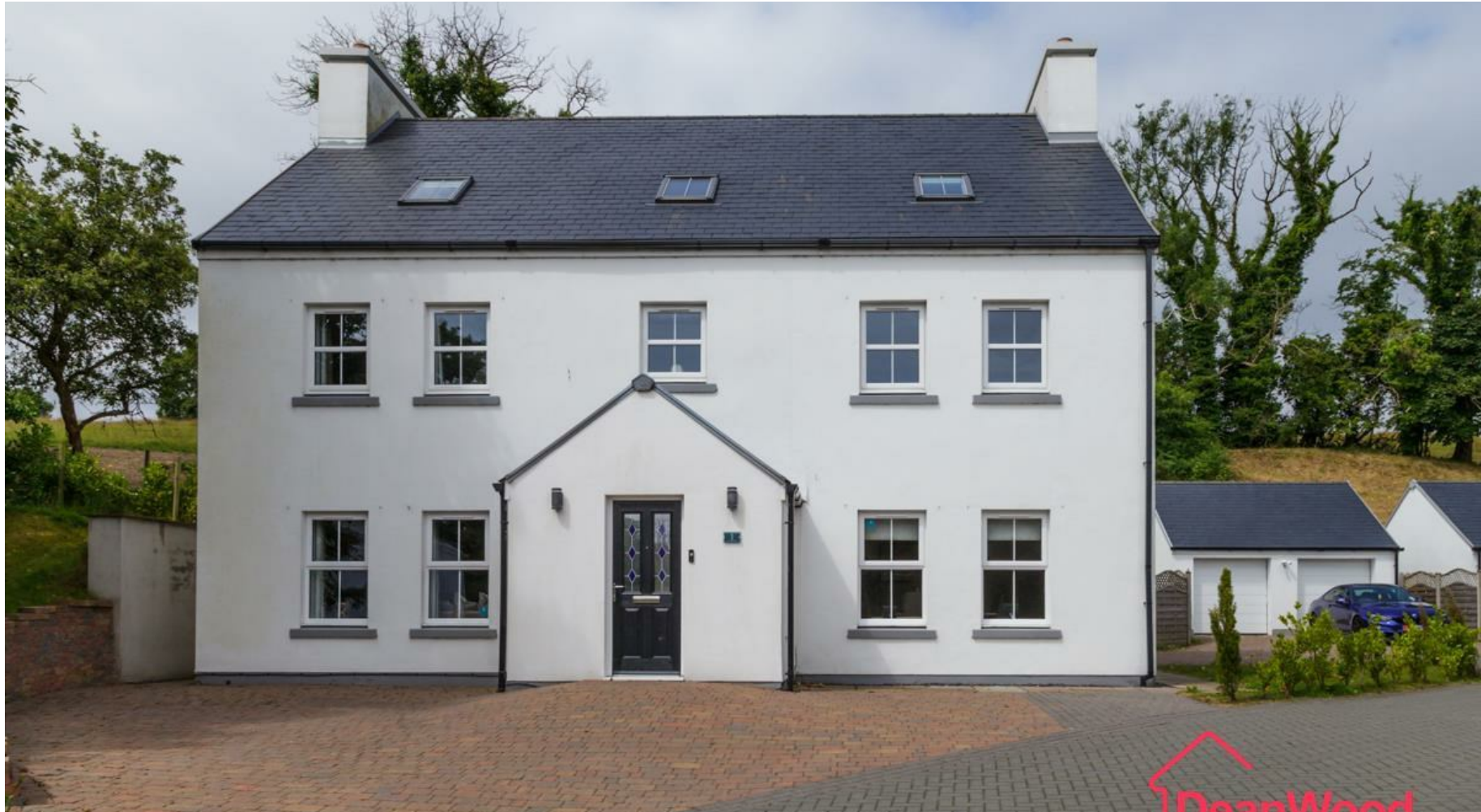
1 Sunnybank, West Baldwin, Isle of Man, IM4 5HB Asking Price £975,000